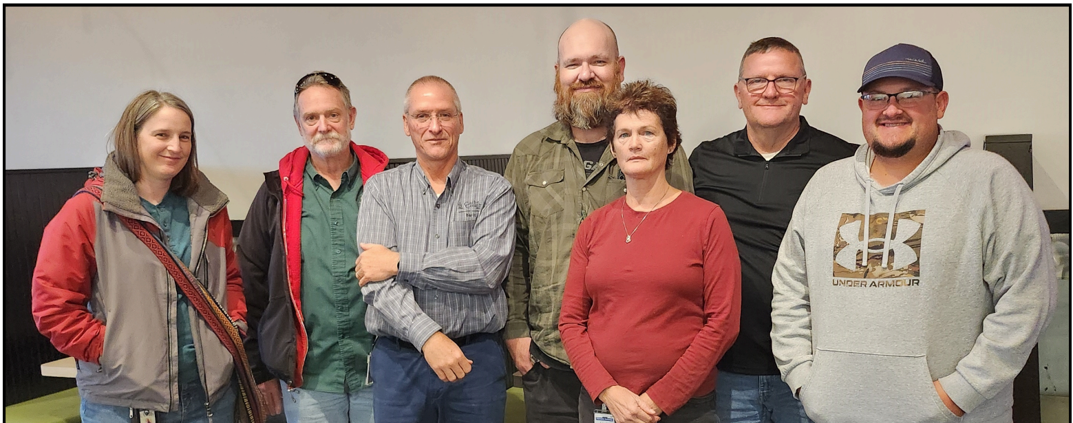
IT Department Infrastructure Team

The top priorities of the Cache County IT Department are the support, maintenance, availability, and security of the technical infrastructure of the Cache County organization including networks, servers, storage, in-house applications, databases, web sites, email systems, communications circuits, phone systems, and employee PCs/ laptops to name just a few.