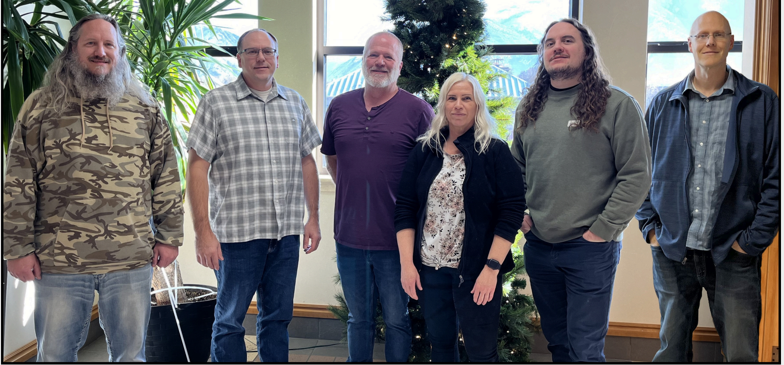
IT Department Developer Team