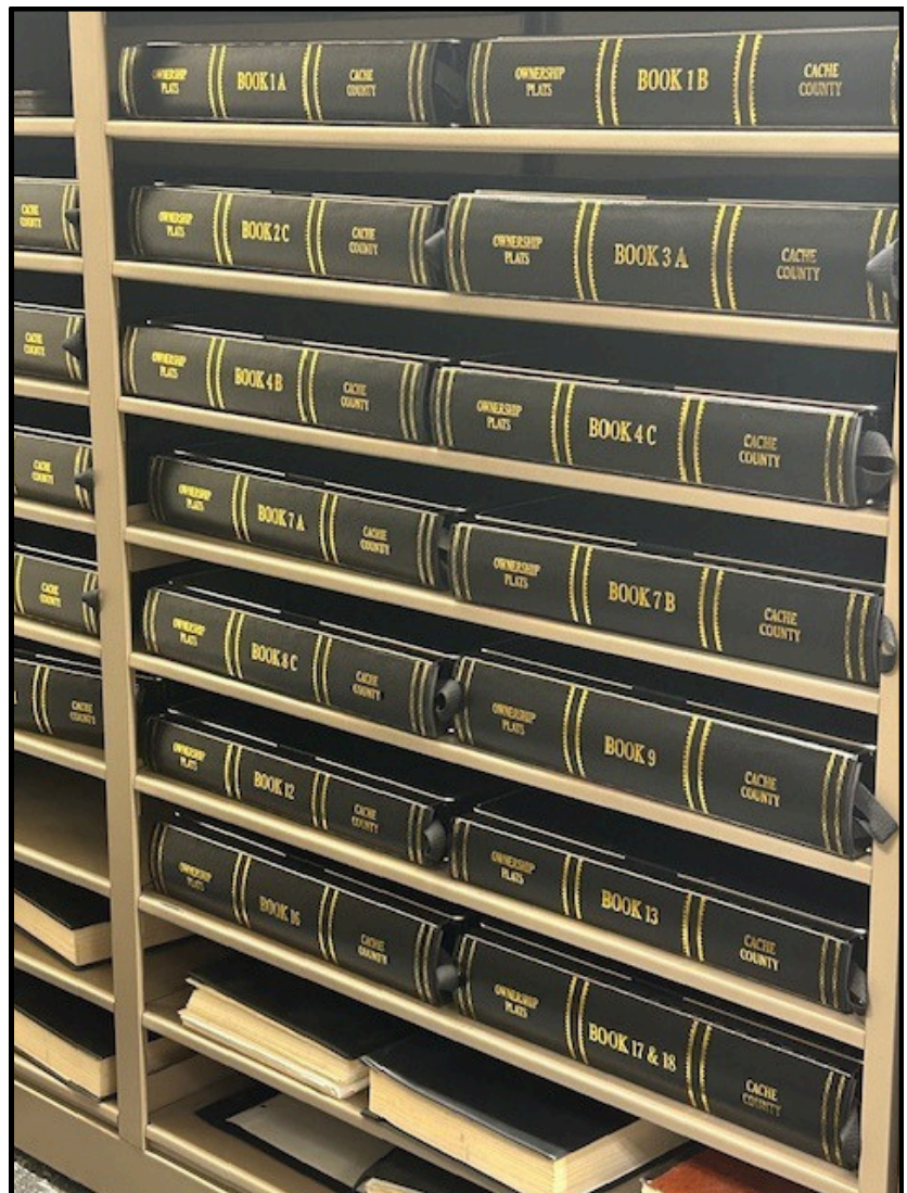
Cache County Recorder Office Vault

August of 2023 marked the launch of Property Watch, a free service provided by the Cache County Recorder's Office. Property Watch informs property owners, or those who have a valid interest in a property, about any document that gets recorded against the property. The program automatically sends an email notification to you the minute the Recorder's Office has processed the document and verified that it affects the property. You can sign up for Cache County Property Watch on the Cache County website at: cachecounty.gov/recorder/propertywatch