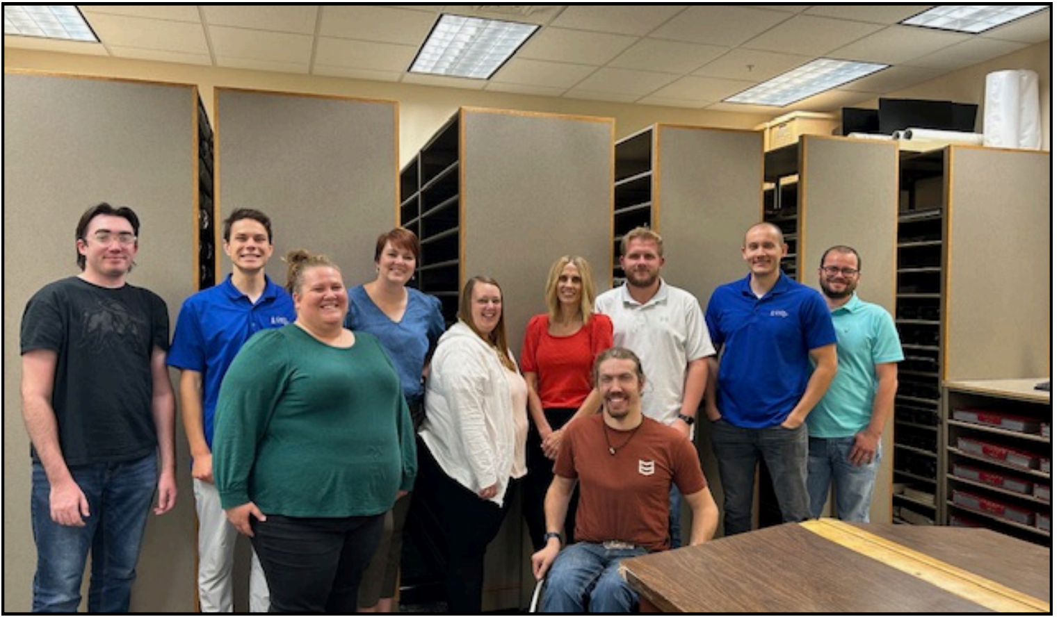
Cache County Recorder Office Staff